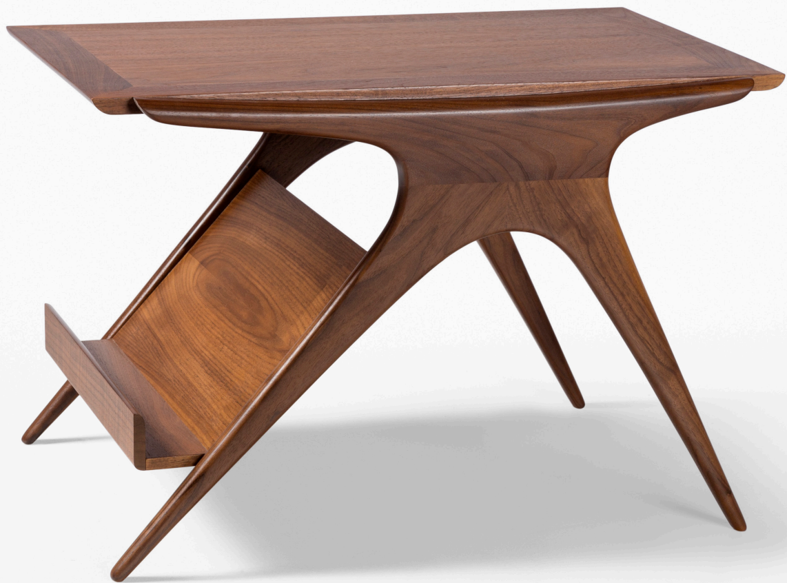
Magazine End Table Model - 441 | Designed 1952